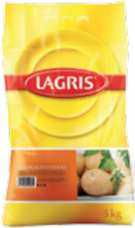
LAGRIS POTATO DUMPLINGS EXCLUSIVE

In the course of the next hundred years approximately, famine rose in continental Europe too, and potatoes found way to our tables too.