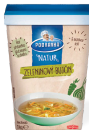
PODRAVKA NATUR VEGETABLE BOUILLON

Weight: 1 kg Product number: H002CQ EAN unit code: 3850104260025 Pcs/ crt: 6 Carton/ pallet: 45 Number of servings: 180/ 0,25 l Expiry date: 15 months