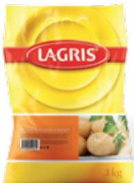
LAGRIS MASHED POTATOES WITH MILK EXCLUSIVE

Weight: 5 kg | 10 kg Product number: C187CZ | C188CZ EAN unit code: 8594004494924 | 8594004491619 Pcs/ crt: 1 | 1 Carton/ pallet: 120 | 60 Number of servings: 50/ 200 g | 100/ 200 g Expiry date: 12 months