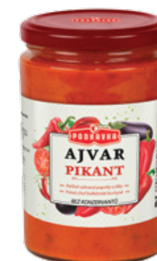
PODRAVKA AJVAR HOT

Weight: 690 g Product number: 5101CQ EAN unit code: 3850104051012 Pcs/ crt: 12 Carton/ pallet: 64 Expiry date: 36 months