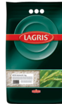
LAGRIS BASMATI I RICE

This rice has small, round or plump grains. It is also called milk rice. It has a high proportion of starch, thanks to which it absorbs water excellently and is very soft and fluffy after cooking. Thanks to its sticky consistency, it suits excellently to prepare diverse stuffings and fillings, the Spanish paella or small rice cakes. It finds great use also in the preparation of soufflés, puddings, milk rice and other sweet meals. Similarly to other kinds of rice, it is naturally gluten-free and has low contents of cholesterol.