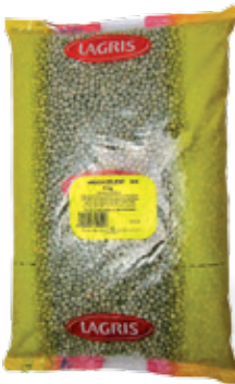
LAGRIS WHOLE GREEN PEAS

Weight: 5 kg Product number: C725CZ EAN unit code: 8594004493095 Pcs/ crt: 1 Carton/ pallet: 120 Number of servings: 45/ 300 g Expiry date: 18 months