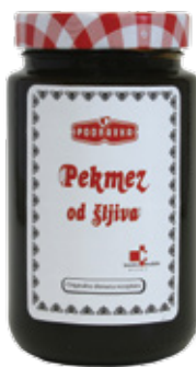
PODRAVKA PLUM SPREAD

Weight: 770 g Product number: A027011 EAN unit code: 3856020214302 Pcs/ crt: 8 Carton/ pallet: 72 Expiry date: 12 months