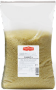
PODRAVKA TARHONYA EGG BARLEY

Weight: 5 kg Product number: A900723 EAN unit code: 8594004491671 Pcs/ crt: 1 Carton/ pallet: 96 Number of servings: 38/ 200 g Expiry date: 36 months