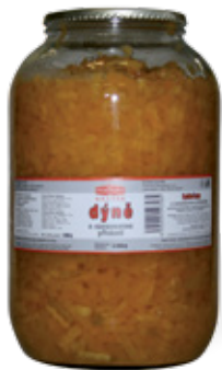
PODRAVKA PUMPKIN WITH PINEAPPLE FLAVOUR Weight: 3,5 kg / 1,75 kg Product number: C798CZ EAN unit code: 8594004493484 Pcs/ crt: 3 Carton/ pallet: 44+8 Expiry date: 48 months