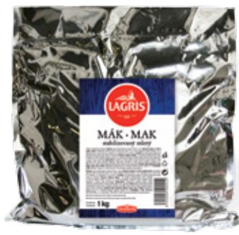
LAGRIS STABILIZED POPPY SEEDS

Weight: 5 kg Product number: C158CZ EAN unit code: 8594004490377 Pcs/ crt: 1 Carton/ pallet: 120 Expiry date: 6 months