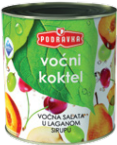
PODRAVKA FRUIT COCKTAIL Weight: 2,6 kg / 1,5 kg Product number: 6849CQ EAN unit code: 3850104068492 Pcs/ crt: 6 Carton/ pallet: 25 Expiry date: 36 months