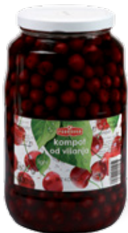
PODRAVKA SOUR CHERRY Weight: 3,6 kg / 1,3 kg Product number: A027441 EAN unit code: 3850104229817 Pcs/ crt: 6 Carton/ pallet: 32 Expiry date: 36 months