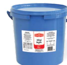
PODRAVKA STRONG BOUILLON

Weight: 1 kg Product number: G712CQ EAN unit code: 3850104257124 Pcs/ crt: 6 Carton/ pallet: 45 Number of servings: 180/ 0,25 l Expiry date: 15 months