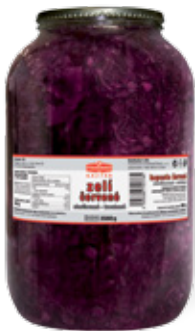
PODRAVKA RED CABBAGE

Weight: 3,3 kg / 1,7 kg Product number: C605CZ EAN unit code: 8594004493170 Pcs/ crt: 3 Carton/ pallet: 44+8 Expiry date: 48 months