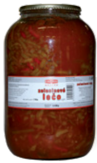
PODRAVKA VEGETABLE MIX

Weight: 3,5 kg / 1,75 kg Product number: C757CZ EAN unit code: 8594004494313 Pcs/ crt: 3 Carton/ pallet: 44+8 Expiry date: 48 months