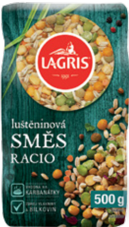
LAGRIS PULSES RATIO MIX Weight: 500 g Product number: CA42CZ EAN unit code: 8594004496997 Pcs/ crt: 6 Carton/ pallet: 240 Expiry date: 12 months

Ideal base for a soup from a combination of legumes, for thickening of ground meat, for patties, mashes, purees, or for spreads. It only contains yellow split peas, lentils, green split peas, red kidney beans, multicoloured beans, small white beans and red lentils.