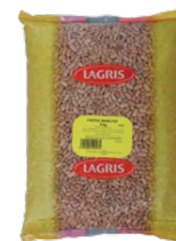
LAGRIS LIGHT SPEC KLED BEANS

Weight: 5 kg Product number: C123CZ EAN unit code: 8594004492265 Pcs/ crt: 1 Carton/ pallet: 60 Number of servings: 45/ 300 g Expiry date: 18 months