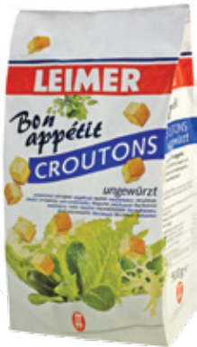
LEIMER FREE FLAVORED CROUTONS

Weight: 1 kg Product number: C995CZ EAN unit code: 4000186032501 Pcs/ crt: 4 Carton/ pallet: 36 Expiry date: 6 months