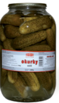
PODRAVKA CUCUMBERS 6 - 9 cm

Weight: 3,5 kg / 1,85 kg Product number: A901555 EAN unit code: 8595686700785 Pcs/ crt: 3 Carton/ pallet: 44+8 Expiry date: 48 months