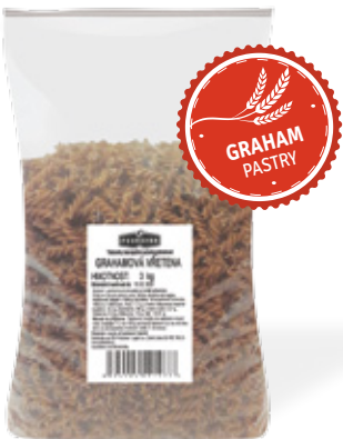
PODRAVKA GRAHAM SPINDLES

Weight: 3 kg Product number: CB60CZ EAN unit code: 8594004492531 Pcs/ crt: 1 Carton/ pallet: 128 Number of servings: 38/ 200 g Expiry date: 36 months