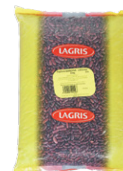
LAGRIS RED KIDNEY BEANS

Weight: 5 kg Product number: C003CZ EAN unit code: 8594004490575 Pcs/ crt: 1 Carton/ pallet: 120 Number of servings: 45/ 300 g Expiry date: 18 months