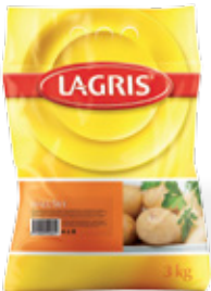
LAGRIS POTATO GNOCCHI EXCLUSIVE

Weight: 3 kg Product number: C496CZ EAN unit code: 8594004494979 Pcs/ crt: 1 Carton/ pallet: 100 Number of servings: 39/ 200 g Expiry date: 12 months