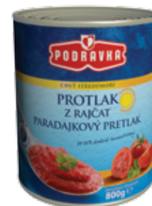
PODRAVKA TOMATO CONCENTRATE

The most ripened tomatoes are used for this product and canned in one piece. Peeled tomatoes suit excellently as a base under meat (particularly beef), for preparation of omelets or stews.