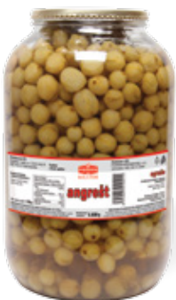
PODRAVKA GOOSEBERRIES COMPOTE Weight: 3,5 kg / 1,8 kg Product number: CB42CZ EAN unit code: 8595686700815 Pcs/ crt: 3 Carton/ pallet: 44+8 Expiry date: 48 months