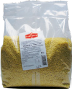
PODRAVKA PASTA LETTERS

Weight: 3 kg Product number: C426CZ EAN unit code: 8594004490711 Pcs/ crt: 1 Carton/ pallet: 100 Number of servings: 176/ 40 g Expiry date: 36 months