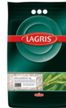
LAGRIS JASMINE RICE

Weight: 5 kg Product number: C005CZ EAN unit code: 8594004490186 Pcs/ crt: 1 Carton/ pallet: 120 Number of servings: 71/ 200 g Expiry date: 18 months