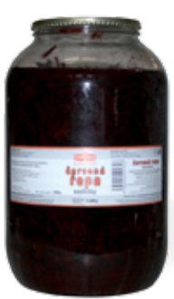
PODRAVKA BEET - VERMICELLI SHAPE

Weight: 3,3 kg / 1,95 kg Product number: C584CZ EAN unit code: 8594004493422 Pcs/ crt: 3 Carton/ pallet: 44+8 Expiry date: 48 months