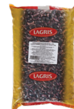
LAGRIS LIGHT SPECKLED PURPLE BEANS

Weight: 5 kg Product number: C002CZ EAN unit code: 8594004490681 Pcs/ crt: 1 Carton/ pallet: 120 Number of servings: 45/ 300 g Expiry date: 18 months