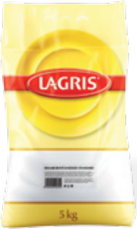
LAGRIS POTATO DUMPLINGS STANDARD

Weight: 5 kg Product number: C167CZ EAN unit code: 8594004494825 Pcs/ crt: 1 Carton/ pallet: 120 Number of servings: 50/ 200 g Expiry date: 12 months