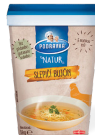
PODRAVKA NATUR CHICKEN BOUILLON

Weight: 1 kg Product number: G999CQ EAN unit code: 3850104259999 Pcs/ crt: 6 Carton/ pallet: 45 Number of servings: 180/ 0,25 l Expiry date: 15 months