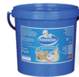
PODRAVKA UNIVERSAL SEASONING

Weight: 2 kg Product number: 1909CQ EAN unit code: 3850104047077 Pcs/ crt: 8 Carton/ pallet: 24 Number of servings: 666 Expiry date: 24 months