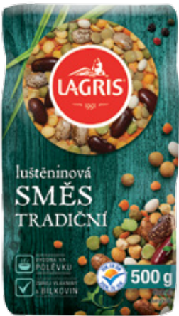
LAGRIS TRADITIONAL PULSES MIX Weight: 500 g Product number: CA44CZ EAN unit code: 8594004497116 Pcs/ crt: 6 Carton/ pallet: 240 Expiry date: 18 months