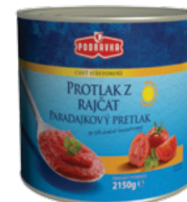
PODRAVKA TOMATO CONCENTRATE

Weight: 800 g Product number: J831CZ EAN unit code: 3850104278310 Pcs/ crt: 12 Carton/ pallet: 72 Expiry date: 36 months