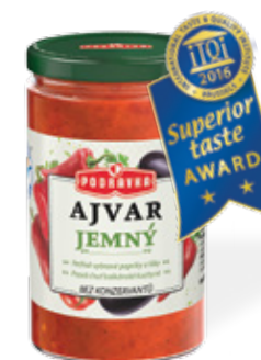
PODRAVKA AJVAR MILD

Podravka offers 2 kinds of ajvar in total - mild and hot.