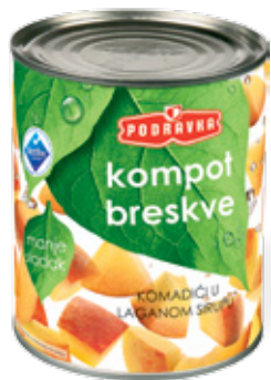
PODRAVKA PEACH COMPOTE Weight: 3 kg / 1,82 kg Product number: G333CQ EAN unit code: 3850104253331 Pcs/ crt: 6 Carton/ pallet: 25 Expiry date: 36 months

You are going to love Podravka canned fruits and not only during the winter season when there is almost no fresh fruit available. Very popular standard canned fruit products include pumpkins with a pineapple flavor and peach canned fruit. Peaches are peeled and cut into cubes, enabling easy and instant consumption. The delicious and flavor-balanced mix of fruits also includes a fruit cocktail from peaches, pears, pineapple, grapes, and cherries. Gooseberry fruit is a one-type canned fruit product from Podravka and is full of vitamins, minerals, and other health-beneficial substances. Thanks to the size of all the single fruits, there is no need for their subsequent adjustment. There are multiple uses for all the canned fruits in the kitchen – from simple canned fruits through to sweet meals, desserts to cocktails. Podravka canned fruits are produced only from the highest quality fruits which ensure their perfect taste. They are prepared for instant consumption and there is no need for their subsequent adjustment.