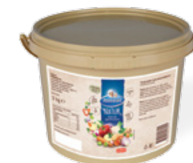
PODRAVKA NATUR SEASONING

Weight: 5 kg Product number: 6482CQ EAN unit code: 3850104964824 Pcs/ crt: 1 Carton/ pallet: 72 Number of servings: 1666 Expiry date: 24 months