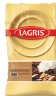
LAGRIS CINNAMON CAKE WITH APPLE PIECES

Weight: 3 kg Product number: C399CZ EAN unit code: 8594004490582 Pcs/ crt: 1 Carton/ pallet: 120 Number of servings: 132 Expiry date: 12 months