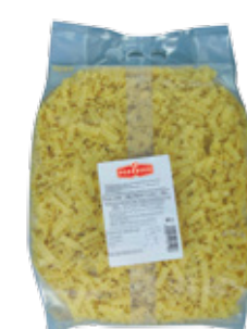
PODRAVKA LASAGNE RIPPLES

Weight: 5 kg Product number: C622CZ EAN unit code: 8594004494344 Pcs/ crt: 1 Carton/ pallet: 60 Number of servings: 63/ 200 g Expiry date: 36 months