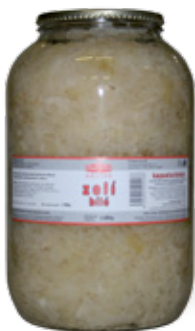
PODRAVKA WHITE CABBAGE

Pickled one-kind or multiple-kind vegetables in the kitchen save time needed for the preparation of meals and enriches the diet with the kinds that are not commonly available out of season. It can be used as an ingredient for the preparation of warm and cold meals, as a cold side dish, or as a classical warm vegetable for ready-made meal. Pickled vegetables, with preserved original taste, are often enhanced by spicier varieties of a pickle.