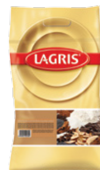
LAGRIS SPELT-YOGURT CAKE WITH FRUIT

Weight: 3 kg Product number: C102CZ EAN unit code: 8594004492715 Pcs/ crt: 1 Carton/ pallet: 120 Number of servings: 84 Expiry date: 12 months