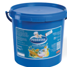
PODRAVKA UNIVERSAL SEASONING WITHOUT MSG

Weight: 10 kg Product number: 4410CQ EAN unit code: 3850104927850 Pcs/ crt: 1 Carton/ pallet: 48 Number of servings: 3332 Expiry date: 24 months