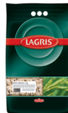
LAGRIS PARBOILED AND WILD INDIAN RICE

Weight: 5 kg Product number: C006CZ EAN unit code: 8594004491312 Pcs/ crt: 1 Carton/ pallet: 120 Number of servings: 71/ 200 g Expiry date: 18 months