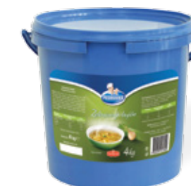
PODRAVKA VEGETABLE BOUILLON

Weight: 1 kg Product number: G710CQ EAN unit code: 3850104257100 Pcs/ crt: 6 Carton/ pallet: 45 Number of servings: 180/ 0,25 l Expiry date: 15 months