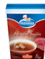
PODRAVKA BEEF BOUILLON

Podravka bouillons are excellent as a basis for both clear and thick soups or various sauces and gravies. They also help to add flavour to meat juices, steamed vegetables, rice or even pasta, which then taste completely different than if they are made in water alone. They are also suitable for basting meat during various thermal treatments such as baking or stewing. The meat becomes much tastier than if it is only basted with water during the preparation.