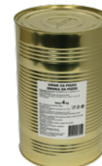
PODRAVKA TOMATO PASSATA WITH HERBS

Weight: 950 g Product number: A032081 EAN unit code: 3856020226619 Pcs/ crt: 6 Carton/ pallet: 60 Expiry date: 36 months