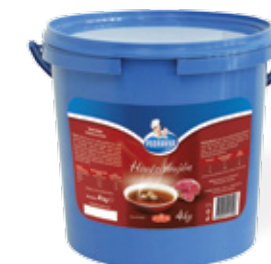
PODRAVKA BEEF BOUILLON

Weight: 1 kg Product number: G707CQ EAN unit code: 3850104257070 Pcs/ crt: 6 Carton/ pallet: 45 Number of servings: 180/ 0,25 l Expiry date: 15 months