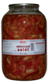
PODRAVKA VEGETABLE SALAD

Weight: 3,4 kg / 1,7 kg Product number: C935CZ EAN unit code: 8594004495006 Pcs/ crt: 3 Carton/ pallet: 44+8 Expiry date: 48 months