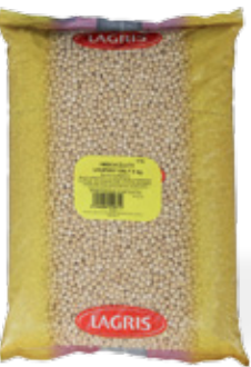
LAGRIS WHOLE YELLOW PEAS PEELED

Weight: 5 kg Product number: C136CZ EAN unit code: 8594004490599 Pcs/ crt: 1 Carton/ pallet: 120 Number of servings: 45/ 300 g Expiry date: 18 months