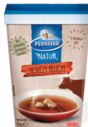
PODRAVKA NATUR BEEF BOUILLON

Weight: 1 kg Product number: G999CQ EAN unit code: 3850104259999 Pcs/ crt: 6 Carton/ pallet: 45 Number of servings: 180/ 0,25 l Expiry date: 15 months