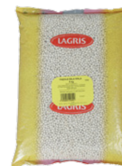
LAGRIS WHITE SMALL BEANS

ripen in red, brown and black colour. They tolerate savoury spices, therefore they are used particularly in Mexican cuisine. They are ideal for example to prepare chilli con Carne.