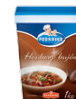
PODRAVKA MUSHROOM BOUILLON

Weight: 4 kg | 10 kg Product number: H001CQ | G998CQ EAN unit code: 3850104260018 | 3850104259982 Pcs/ crt: 1 | 1 Carton/ pallet: 72 | 24 Number of servings: 720/ 0,25 l | 1800/ 0,25 l Expiry date: 18 months