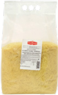
PODRAVKA VERMICELLI PASTA

TARHONYA Tarhonya is a type of pasta from standard soft wheat and is a traditional side dish mainly in the regions of Slovakia and eastern Moravia. As well as tarhonyas from other producers, tarhonya from Podravka is produced from 100% semolina and thanks to this, Podravka has created a unique product by combining tradition with the high quality and properties of semolina flour..