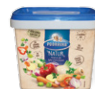
PODRAVKA NATUR SEASONING

Weight: 3 kg Product number: G304CQ EAN unit code: 3850104253041 Pcs/ crt: 1 Carton/ pallet: 90 Number of servings: 1000 Expiry date: 24 months