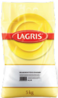
LAGRIS POTATO DOUGH STANDARD

Weight: 5 kg Product number: C182CZ EAN unit code: 8594004494894 Pcs/ crt: 1 Carton/ pallet: 120 Number of servings: 50/ 200 g Expiry date: 12 months