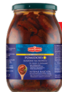
PODRAVKA DRIED TOMATOES

Weight: 400 g Product number: A030359 EAN unit code: 3850104238802 Pcs/ crt: 12 Carton/ pallet: 144 Expiry date: 36 months