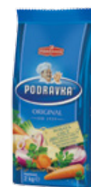
PODRAVKA UNIVERSAL SEASONING

Weight: 1 kg Product number: E580CQ EAN unit code: 3850104047046 Pcs/ crt: 10 Carton/ pallet: 60 Number of servings: 333 Expiry date: 24 months