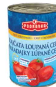
PODRAVKA WHOLE PEELED TOMATOES

Weight: 2150 g Product number: J830CZ EAN unit code: 3850104278303 Pcs/ crt: 6 Carton/ pallet: 50 Expiry date: 36 months