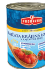
PODRAVKA CHOPPED PEELED TOMATO

Weight: 500 g Product number: H217CQ EAN unit code: 3850104073656 Pcs/ crt: 12 Carton/ pallet: 108 Expiry date: 36 months