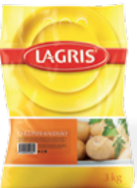
LAGRIS POTATO DUMPLINGS EXCLUSIVE

Weight: 3 kg Product number: C173CZ EAN unit code: 8594004494658 Pcs/ crt: 1 Carton/ pallet: 120 Number of servings: 82/ 200 g Expiry date: 12 months