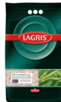
LAGRIS ROUND GRAIN RICE

Weight: 3 kg Product number: C654CZ EAN unit code: 8594004492807 Pcs/ crt: 1 Carton/ pallet: 216 Number of servings: 85/ 200 g Expiry date: 18 months