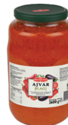
PODRAVKA AJVAR MILD

Weight: 690 g Product number: 5057CQ EAN unit code: 3850104050572 Pcs/ crt: 12 Carton/ pallet: 64 Expiry date: 36 months