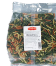
PODRAVKA FUSILLI TRICOLORI

Weight: 5 kg Product number: C624CZ EAN unit code: 8594004494009 Pcs/ crt: 1 Carton/ pallet: 60 Number of servings: 63/ 200 g Expiry date: 36 months