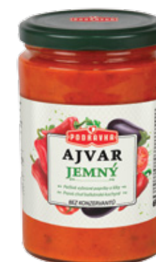
PODRAVKA AJVAR MILD

Weight: 350 g Product number: 5056CQ EAN unit code: 3850104050565 Pcs/ crt: 12 Carton/ pallet: 65 Expiry date: 36 months