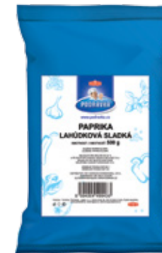
PODRAVKA RED PEPPER

Caraway is one of the oldest used spices in Europe. It is often used to season bread, potatoes, sauces, salads, cooked mushrooms, cabbage, etc., and is, therefore, an essential part of Czech cuisine. Caraway also assists digestion and helps fight flatulence, so it's appropriate for the preparation of legumes.