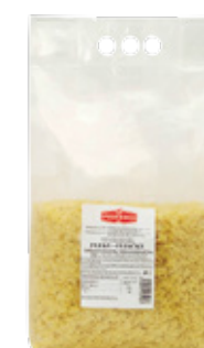
PODRAVKA PASTA FLAKES

Weight: 5 kg Product number: C551CZ EAN unit code: 8594004494528 Pcs/ crt: 1 Carton/ pallet: 60 Number of servings: 63/ 200 g Expiry date: 36 months