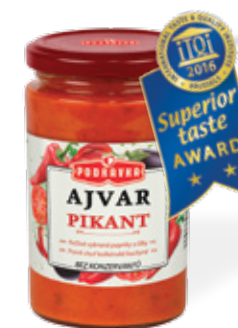
PODRAVKA AJVAR HOT

Weight: 350 g Product number: 5102CQ EAN unit code: 3850104051029 Pcs/ crt: 12 Carton/ pallet: 65 Expiry date: 36 months