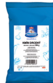
PODRAVKA CARAWAY SEEDS GROUND

Weight: 500 g Product number: CB59CZ EAN unit code: 8594004496331 Pcs/ crt: 12 Carton/ pallet: 48 Expiry date: 24 months