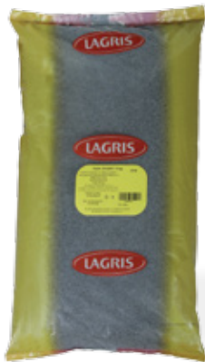
LAGRIS BLUE POPPY SEEDS

Weight: 1 kg Product number: A029256 EAN unit code: 3850104259418 Pcs/ crt: 6 Carton/ pallet: 63 Expiry date: 12 months