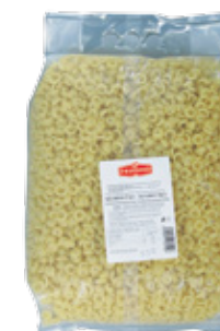
PODRAVKA PASTA HATS

Weight: 5 kg Product number: C617CZ EAN unit code: 8594004493996 Pcs/ crt: 1 Carton/ pallet: 60 Number of servings: 63/ 200 g Expiry date: 36 months