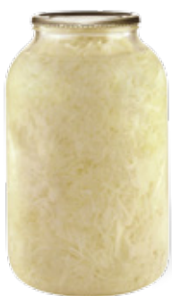
PODRAVKA WHITE CABBAGE STANDARD

Weight: 3,5 kg / 1,75 kg Product number: C581CZ EAN unit code: 8594004494436 Pcs/ crt: 3 Carton/ pallet: 44+8 Expiry date: 48 months