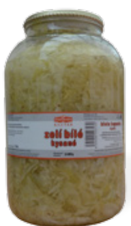
PODRAVKA HEAD CABBAGE SAUERKRAUT

Weight: 3,3 kg / 1,7 kg Product number: A900169 EAN unit code: 8594004491244 Pcs/ crt: 1 Carton/ pallet: 140 Expiry date: 36 months