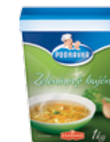
PODRAVKA VEGETABLE BOUILLON

Weight: 4 kg Product number: G708CQ EAN unit code: 3850104457081 Pcs/ crt: 1 Carton/ pallet: 72 Number of servings: 720/ 0,25 l Expiry date: 15 months