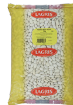
LAGRIS WHITE BIG BEANS

Weight: 5 kg Product number: C106CZ EAN unit code: 8594004490551 Pcs/ crt: 1 Carton/ pallet: 120 Number of servings: 45/ 300 g Expiry date: 18 months