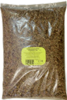
LAGRIS LENTILS STANDARD

Weight: 5 kg Product number: C097CZ EAN unit code: 8594004490513 Pcs/ crt: 1 Carton/ pallet: 120 Number of servings: 45/ 300 g Expiry date: 18 months