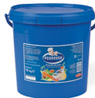
PODRAVKA UNIVERSAL SEASONING

Weight: 5 kg Product number: 3769CQ EAN unit code: 3850104062445 Pcs/ crt: 1 Carton/ pallet: 72 Number of servings: 1666 Expiry date: 24 months