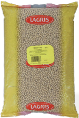
LAGRIS SOYA BEANS

Weight: 5 kg Product number: C144CZ EAN unit code: 8594004490667 Pcs/ crt: 1 Carton/ pallet: 120 Number of servings: 45/ 300 g