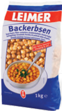
LEIMER FRIED PEAS

Weight: 5 kg Product number: C973CZ EAN unit code: 8594004498427 Pcs/ crt: 1 Carton/ pallet: 120 Number of servings: 55/ 160 g Expiry date: 12 months