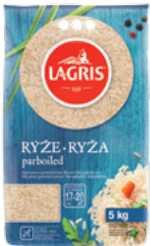
LAGRIS LONG GRAIN RICE PARBOILED

Weight: 5 kg Product number: C008CZ EAN unit code: 8594004490032 Pcs/ crt: 1 Carton/ pallet: 120 Number of servings: 71/ 200 g Expiry date: 24 months