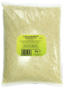
LAGRIS RICE PARBOILED

Weight: 5 kg Product number: C010CZ EAN unit code: 8594004490018 Pcs/ crt: 1 Carton/ pallet: 120 Number of servings: 85/ 200 g Expiry date: 18 months