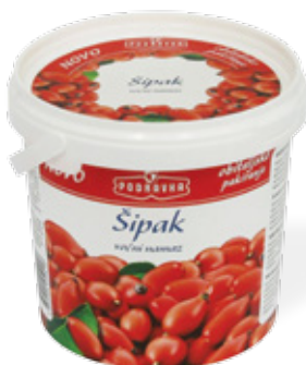
PODRAVKA ROSEHIP SPREAD

Weight: 850 g Product number: A025669 EAN unit code: 3856020214210 Pcs/ crt: 8 Carton/ pallet: 72 Expiry date: 36 months