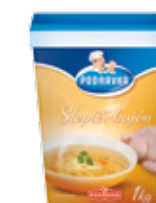
PODRAVKA CHICKEN BOUILLON

Weight: 4 kg | 10 kg Product number: G709CQ | G704CQ EAN unit code: 3850104457098 | 3850104457043 Pcs/ crt: 1 | 1 Carton/ pallet: 72 | 24 Number of servings: 720/ 0,25 l | 1800/ 0,25 l Expiry date: 15 months