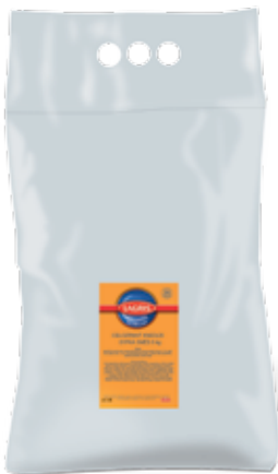
LAGRIS WHOLE-WHEAT DUMPLING

Croutons are mildly salted crispy cubes, baked until they reach a golden colour. They are appropriate for creamy vegetable soups, but also perfect in light salads with vegetables or meat.