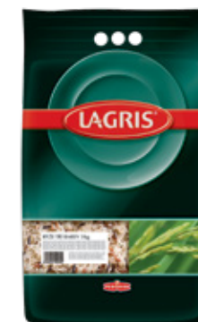
LAGRIS THREE-COLORS RICE

Weight: 5 kg Product number: C082CZ EAN unit code: 8594004490162 Pcs/ crt: 1 Carton/ pallet: 120 Number of servings: 85/ 200 g Expiry date: 18 months