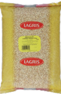
LAGRIS WHOLE YELLOW PEAS PEELED SPLIT

Weight: 5 kg Product number: C129CZ EAN unit code: 8594004490612 Pcs/ crt: 1 Carton/ pallet: 120 Number of servings: 45/ 300 g Expiry date: 18 months