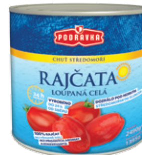
PODRAVKA WHOLE PEELED TOMATOES

Weight: 400 g Product number: 8794CZ EAN unit code: 3850104073724 Pcs/ crt: 12 Carton/ pallet: 144 Expiry date: 36 months