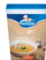
PODRAVKA GARLIC BOUILLON

Weight: 4 kg Product number: G705CQ EAN unit code: 3850104457050 Pcs/ crt: 1 Carton/ pallet: 72 Number of servings: 720/ 0,25 l Expiry date: 15 months