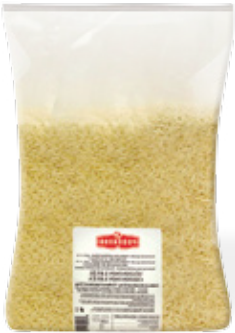
PODRAVKA PASTA RICE SEMOLINA

Weight: 3 kg Product number: C606CZ EAN unit code: 8594004490728 Pcs/ crt: 1 Carton/ pallet: 100 Number of servings: 176/ 40 g Expiry date: 36 months