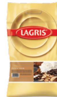
LAGRIS GINGERBREAD WITH FRUIT

Weight: 3 kg Product number: C388CZ EAN unit code: 8594004490568 Pcs/ crt: 1 Carton/ pallet: 120 Number of servings: 108 Expiry date: 12 months