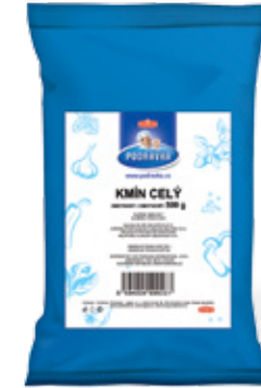
PODRAVKA WHOLE CARAWAY SEEDS

Weight: 500 g Product number: CB57CZ EAN unit code: 8594004496430 Pcs/ crt: 12 Carton/ pallet: 48 Expiry date: 24 months