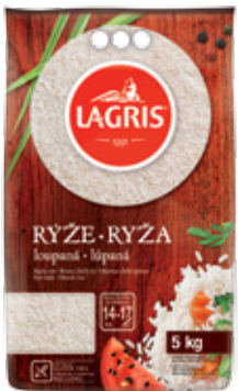
LAGRIS LONG GRAIN RICE

Weight: 5 kg Product number: C008CZ EAN unit code: 8594004490032 Pcs/ crt: 1 Carton/ pallet: 120 Number of servings: 71/ 200 g Expiry date: 24 months