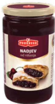
PODRAVKA SOUR CHERRY FILLING

Poppy as a foodstuff has been grown since the ninth century particularly by Slavic nations. It has been traditionally used also in Turkish and Jewish cuisine. At present, the poppy is grown the most in Turkey, but the Czech Republic ranks among its important world producers. Poppy seeds contain up to 60 % of oil, proteins and trace elements.