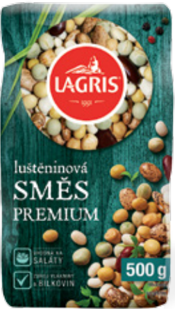
LAGRIS PULSES PREMIUM MIX Weight: 500 g Product number: CA43CZ EAN unit code: 8594004497000 Pcs/ crt: 6 Carton/ pallet: 240 Expiry date: 18 months