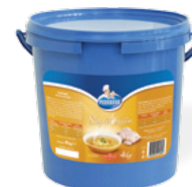
PODRAVKA CHICKEN BOUILLON

Weight: 1 kg Product number: G706CQ EAN unit code: 3850104257063 Pcs/ crt: 6 Carton/ pallet: 45 Number of servings: 180/ 0,25 l Expiry date: 15 months