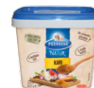
PODRAVKA NATUR SEASONING CURRY

Weight: 1 kg Product number: J046CQ EAN unit code: 3850104270468 Pcs/ crt: 6 Carton/ pallet: 72 Number of servings: 333 Expiry date: 24 months