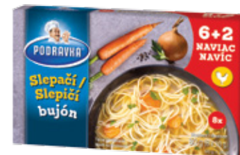
PODRAVKA CHICKEN BOUILLON CUBES

Weight: 120 g Product number: H719CQ EAN unit code: 3850104267192 Pcs/ crt: 15 Carton/ pallet: 300 Expiry date: 14 months