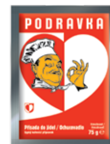
PODRAVKA UNIVERSAL SEASONING

New in this category is Podravka Natur liquid seasoning, which will become your indispensable helper in the kitchen. It contains only natural ingredients, sea salt and is glutamate free, without artificial colours or aromas. Great for your soups, sauces, meat or vegetable dishes, fish and salads. You can also use it as part of a meat or fish marinade.