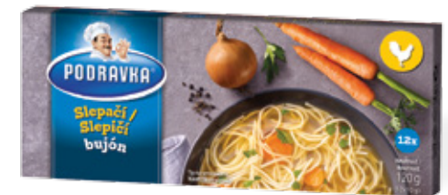
PODRAVKA CHICKEN BOUILLON CUBES

Weight: 80 g Product number: J528CQ EAN unit code: 3850104275289 Pcs/ crt: 15 Carton/ pallet: 468 Expiry date: 14 months