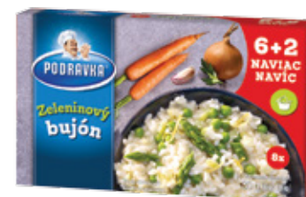
PODRAVKA VEGETABLE BOUILLON CUBES

Weight: 120 g Product number: H721CQ EAN unit code: 3850104267215 Pcs/ crt: 15 Carton/ pallet: 300 Expiry date: 14 months