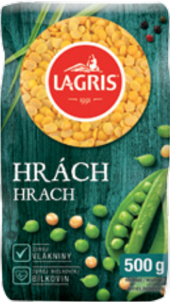
LAGRIS YELLOW PEAS PEELED SPLIT

Weight: 500 g Product number: C137CZ EAN unit code: 8594004494108 Pcs/ crt: 12 Carton/ pallet: 126 Expiry date: 18 months