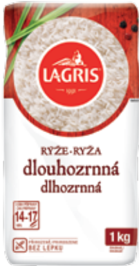
LAGRIS PEELED RICE ECONOM

Weight: 1 kg Product number: C009CZ EAN unit code: 8594004491152 Pcs/ crt: 6 Carton/ pallet: 126 Expiry date: 24 months