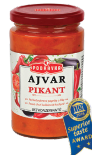
PODRAVKA AJVAR HOT

Weight: 350 g Product number: 5102CQ EAN unit code: 3850104051029 Pcs/ crt: 12 Carton/ pallet: 65 Expiry date: 48 months