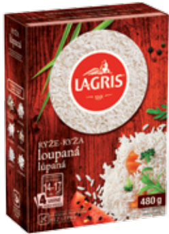
LAGRIS PEELED RICE BOILING BAGS

Weight: 480 g Product number: A900192 EAN unit code: 8594004491107 Pcs/ crt: 16 Carton/ pallet: 72 Expiry date: 24 months