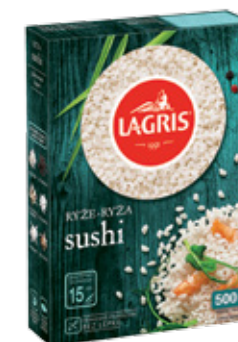
LAGRIS SUSHI RICE

Weight: 400 g Product number: C749CZ EAN unit code: 8594004491879 Pcs/ crt: 7 Carton/ pallet: 144 Expiry date: 18 months