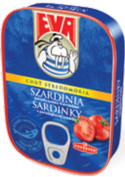
EVA SARDINES IN TOMATO SAUCE

Weight: 115 g Product number: F614CZ EAN unit code: 3859888140073 Pcs/ crt: 30 Carton/ pallet: 162 Expiry date: 48 months