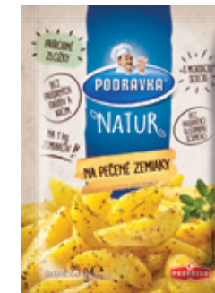
PODRAVKA NATUR SPECIAL SEASONING BAKED POTATOES

Weight: 25 g Product number: A027861 EAN unit code: 5907573339702 Pcs/ crt: 20 Carton/ pallet: 100 Expiry date: 24 months