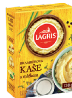
LAGRIS MASHED POTATOES WITH MILK

Weight: 130 g Product number: C486CZ EAN unit code: 8594004494702 Pcs/ crt: 8 Carton/ pallet: 144 Expiry date: 12 months