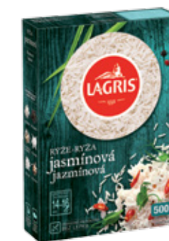
LAGRIS JASMINE RICE

Weight: 400 g Product number: C664CZ EAN unit code: 8594004494191 Pcs/ crt: 7 Carton/ pallet: 144 Expiry date: 18 months