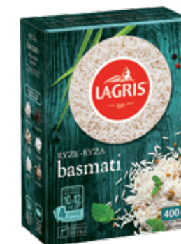
LAGRIS BASMATI RICE BOILING BAGS

Weight: 500 g Product number: C013CZ EAN unit code: 8594004491190 Pcs/ crt: 8 Carton/ pallet: 192 Expiry date: 18 months