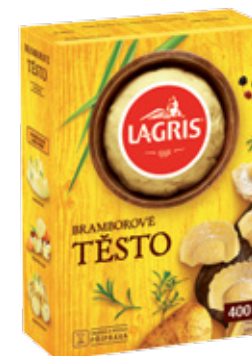
LAGRIS POTATO DOUGH

Weight: 130 g Product number: C487CZ EAN unit code: 8594004492111 Pcs/ crt: 8 Carton/ pallet: 144 Expiry date: 12 months