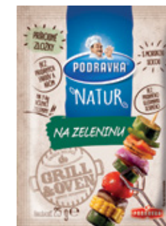
PODRAVKA NATUR SPECIAL SEASONING BAKED VEGETABLES

Weight: 25 g Product number: A027858 EAN unit code: 5907573339849 Pcs/ crt: 20 Carton/ pallet: 100 Expiry date: 24 months