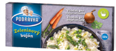
PODRAVKA VEGETABLE BOUILLON CUBES

Weight: 80 g Product number: J530CQ EAN unit code: 3850104275302 Pcs/ crt: 15 Carton/ pallet: 468 Expiry date: 14 months