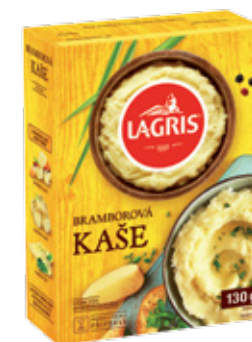
LAGRIS MASHED POTATOES

In the course of the next hundred years approximately, famine rose in continental Europe too, and potatoes found way to our tables too.