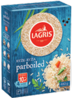
LAGRIS RICE PARBOILED 10 MIN. BOILING BAGS

Weight: 1 kg Product number: C045CZ EAN unit code: 8594004491169 Pcs/ crt: 6 Carton/ pallet: 126 Expiry date: 18 months