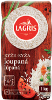
LAGRIS PEELED RICE

Weight: 960 g Product number: C054CZ EAN unit code: 8594004491237 Pcs/ crt: 14 Carton/ pallet: 40 Expiry date: 24 months