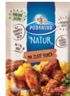
PODRAVKA NATUR SPECIAL SEASONING GOLDEN CHICKEN

Weight: 25 g Product number: A027861 EAN unit code: 5907573339702 Pcs/ crt: 20 Carton/ pallet: 100 Expiry date: 24 months