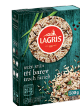
LAGRIS THREE-COLOUR RICE

Weight: 500 g Product number: C665CZ EAN unit code: 8594004494177 Pcs/ crt: 8 Carton/ pallet: 192 Expiry date: 18 months