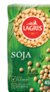
LAGRIS SOYA BEANS

Weight: 500 g Product number: C153CZ EAN unit code: 8594004496256 Pcs/ crt: 6 Carton/ pallet: 240 Expiry date: 12 months