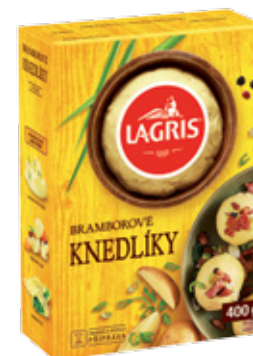
LAGRIS POTATO DUMPLINGS

Weight: 400 g Product number: C490CZ EAN unit code: 8594004494726 Pcs/ crt: 14 Carton/ pallet: 72 Expiry date: 12 months