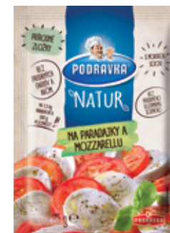
PODRAVKA NATUR SPECIAL SEASONING FOR TOMATOES AND MOZZARELLA

Weight: 25 g Product number: A027862 EAN unit code: 5907573339764 Pcs/ crt: 20 Carton/ pallet: 100 Expiry date: 24 months