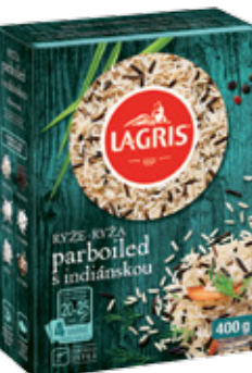
LAGRIS PARBOILED AND WILD INDIAN RICE BOILING BAGS

Weight: 500 g Product number: C083CZ EAN unit code: 8594004491268 Pcs/ crt: 8 Carton/ pallet: 192 Expiry date: 18 months