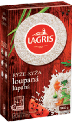
LAGRIS PEELED RICE BOILING BAGS

Weight: 480 g Product number: A900192 EAN unit code: 8594004491107 Pcs/ crt: 16 Carton/ pallet: 72 Expiry date: 24 months