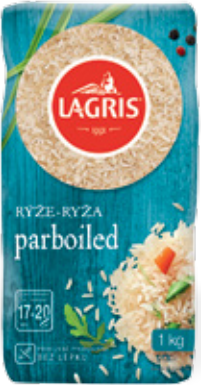
LAGRIS RICE PARBOILED

Weight: 500 g Product number: C044CZ EAN unit code: 8594004491763 Pcs/ crt: 12 Carton/ pallet: 112 Expiry date: 18 months