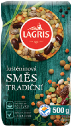
LAGRIS TRADITIONAL PULSES MIX

Weight: 500 g Product number: CA43CZ EAN unit code: 8594004497000 Pcs/ crt: 6 Carton/ pallet: 240 Expiry date: 18 months