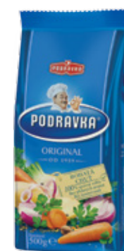
PODRAVKA UNIVERSAL SEASONING

Weight: 190 g Product number: H310CQ EAN unit code: 3850104263101 Pcs/ crt: 18 Carton/ pallet: 102 Expiry date: 24 months