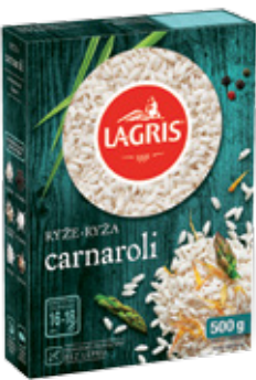
LAGRIS CARNAROLI RICE

Weight: 500 g Product number: C663CZ EAN unit code: 8594004494184 Pcs/ crt: 8 Carton/ pallet: 192 Expiry date: 18 months