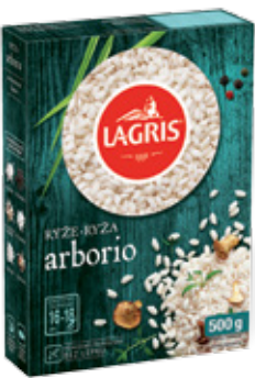
LAGRIS ARBORIO RICE

Indian (or wild) rice consists of water grass seeds and it was originally the basic cereal of the Indians living in the area of Great Lakes at the American-Canadian border. Hungary is an important European manufacturer of that rice.