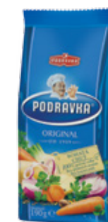
PODRAVKA UNIVERSAL SEASONING

Weight: 100 g Product number: H839CQ EAN unit code: 3850104268397 Pcs/ crt: 12 Carton/ pallet: 100 Expiry date: 24 months