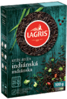
LAGRIS WILD INDIAN RICE

Weight: 400 g Product number: C063CZ EAN unit code: 8594004491343 Pcs/ crt: 7 Carton/ pallet: 144 Expiry date: 18 months