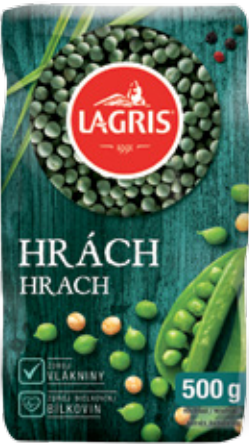
LAGRIS GREEN PEAS WHOLE

Peas have been known to people for thousands of years and it is no wonder that it has been grown by ancient Romans. Peas, whether green or yellow, contain plant proteins, fibre, vitamins and minerals. It can partially replace animal proteins, feed and is gluten-free. Yellow peas (especially halved) is better digestible, does not have to be soaked, it is suitable for the preparation of porridge, puree and thick soups. Also popular are green peas, which has a stronger taste compared to yellow. It's ideal to prepare various porridge, puree or soups.