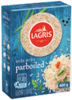
LAGRIS RICE PARBOILED BOILING BAGS

The energy value of rice is high, but it is easily digestible. High-quality rice should be cream-white, parboiled rice goldish, and it should have a floury or glassy appearance. Each kind of rice has its own, a little different flavour and aroma, depending on the specific kind and place of origin.