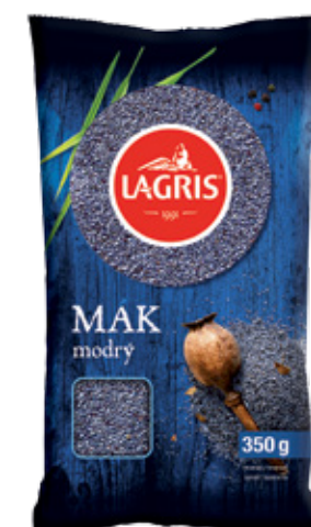
LAGRIS BLUE POPPY SEEDS

Weight: 350 g Product number: A900624 EAN unit code: 8594004492517 Pcs/ crt: 20 Carton/ pallet: 80 Expiry date: 6 months