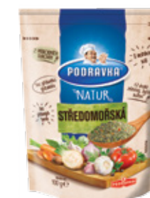
PODRAVKA NATUR MEDITERRANEAN UNIVERSAL SEASONING

Weight: 150 g Product number: F883CQ EAN unit code: 3850104248832 Pcs/ crt: 12 Carton/ pallet: 85 Expiry date: 24 months