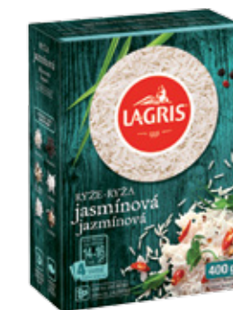
LAGRIS JASMINE RICE BOILING BAGS

Weight: 500 g Product number: C014CZ EAN unit code: 8594004491183 Pcs/ crt: 8 Carton/ pallet: 192 Expiry date: 18 months