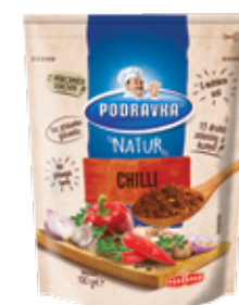
PODRAVKA NATUR CHILLI UNIVERSAL SEASONING

Weight: 100 g Product number: H831CQ EAN unit code: 5901315054373 Pcs/ crt: 12 Carton/ pallet: 100 Expiry date: 24 months