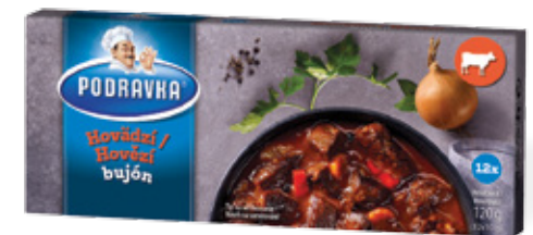
PODRAVKA BEEF BOUILLON CUBES

Weight: 80 g Product number: J526CQ EAN unit code: 3850104275265 Pcs/ crt: 15 Carton/ pallet: 468 Expiry date: 14 months