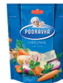
PODRAVKA UNIVERSAL SEASONING

Weight: 75 g Product number: 1905CQ EAN unit code: 3850104008054 Pcs/ crt: 35 Carton/ pallet: 102 Expiry date: 24 months