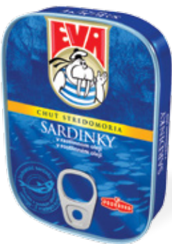
EVA SARDINES IN VEGETABLE OIL

Eva sardines are completely preservative and another additive free. Enjoy Eva sardines in several delicious variations: in olive and vegetable oil, with lemon, in tomato sauce, in tomato sauce with vegetables and in vegetable oil with hot pepper.