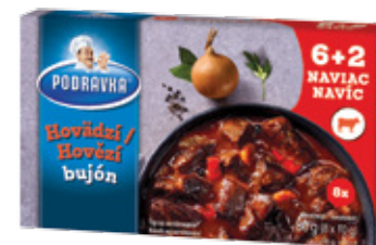
PODRAVKA BEEF BOUILLON CUBES

Podravka bouillons are excellent as a basis for both clear and thick soups or various sauces and gravies. They also help to add flavour to meat juices, steamed vegetables, rice or even pasta, which then taste completely different than if they are made in water alone. They are also suitable for basting meat during various thermal treatments such as baking or stewing. The meat becomes much tastier than if it is only basted with water during the preparation.