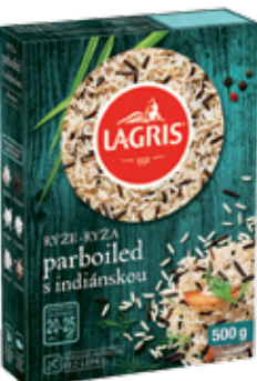
LAGRIS PARBOILED AND WILD INDIAN RICE

Weight: 500 g Product number: CB62CZ EAN unit code: 8594004496201 Pcs/ crt: 8 Carton/ pallet: 192 Expiry date: 18 months