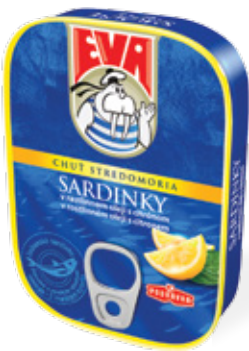
EVA SARDINES IN VEGETABLE OIL WITH LEMON

Weight: 115 g Product number: F613CZ EAN unit code: 3859888140004 Pcs/ crt: 30 Carton/ pallet: 162 Expiry date: 48 months