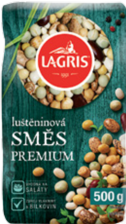
LAGRIS PULSES PREMIUM MIX

Weight: 500 g Product number: CA42CZ EAN unit code: 8594004496997 Pcs/ crt: 6 Carton/ pallet: 240 Expiry date: 12 months