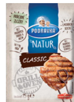
PODRAVKA NATUR SPECIAL SEASONING GRILL CLASSIC

Weight: 25 g Product number: A027860 EAN unit code: 5907573339740 Pcs/ crt: 20 Carton/ pallet: 100 Expiry date: 24 months