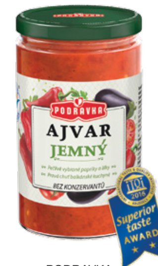
PODRAVKA AJVAR MILD

Podravka offers 2 kinds of ajvar in total - mild and hot.