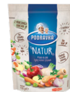
PODRAVKA NATUR UNIVERSAL SEASONING

Weight: 500 g Product number: 1908CQ EAN unit code: 3850104008443 Pcs/ crt: 12 Carton/ pallet: 80 Expiry date: 24 months