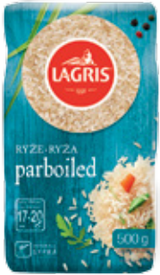
LAGRIS RICE PARBOILED

Weight: 960 g Product number: C635CZ EAN unit code: 8594004491626 Pcs/ crt: 14 Carton/ pallet: 40 Expiry date: 18 months