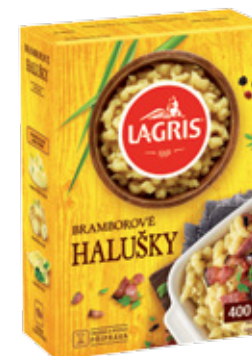
LAGRIS POTATO GNOCCHI

Weight: 400 g Product number: C489CZ EAN unit code: 8594004494719 Pcs/ crt: 14 Carton/ pallet: 72 Expiry date: 12 months