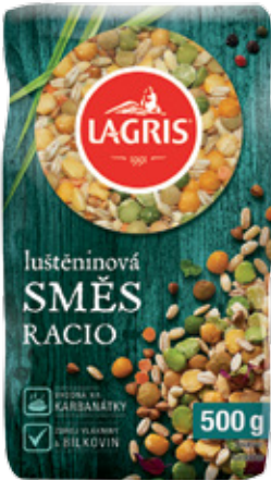
LAGRIS PULSES RATIO MIX

Ideal base for a soup from a combination of legumes, for thickening of ground meat, for patties, mashes, purees, or for spreads. It only contains yellow split peas, lentils, green split peas, red kidney beans, multicoloured beans, small white beans and red lentils.