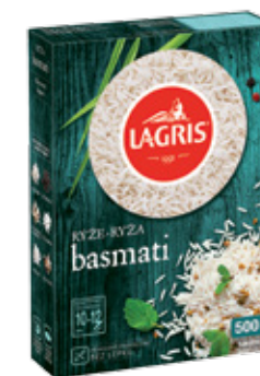
LAGRIS BASMATI RICE

Three-colour rice joins parboiled, red and Indian rice, creating a unique combination of aroma, flavour and appearance. The North American wild long-grain rice consists actually of water grass seeds; the red long grain rice represents a special kind of unpeeled rice.