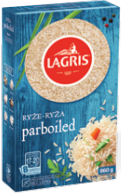
LAGRIS RICE PARBOILED BOILING BAGS

Weight: 480 g Product number: A900196 EAN unit code: 8594004491213 Pcs/ crt: 16 Carton/ pallet: 72 Expiry date: 18 months